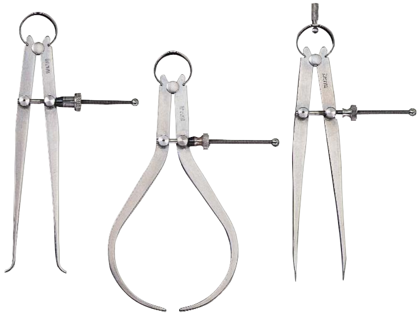
Left to right: No. 73B-6 Inside Caliper, No. 79A-6 Outside Caliper and No. 83A-6 Divider.

Quick-adjusting spring nut makes fast, accurate settings.